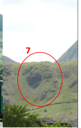
Brenhines yr Wyddfa The Lady of Snowdon