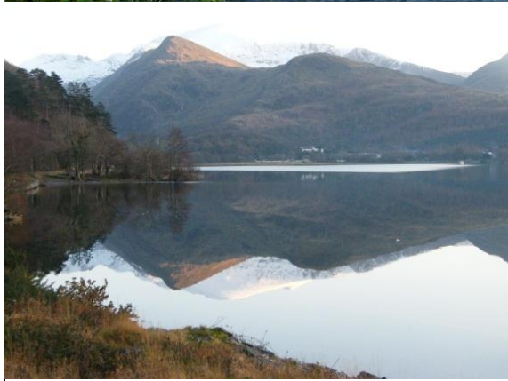
Llyn Padarn a mynyddoedd Eryri yn y gaeaf Lake Padarn and the Snowdonia mountains in Winter